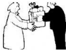
Giving food to a person in need