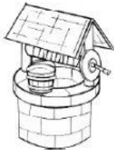
Helping build a well or giving money to help build one