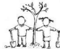
Plant a tree to give shade to people and animals