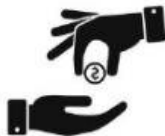
Giving someone some change at the grocery store