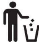
Pick up litter from the ground