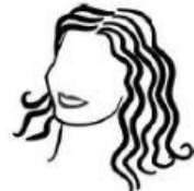
Smile to a passing stranger