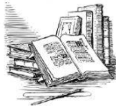
Writing books that teach students about their deen