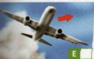
The plane is turned around in the air.