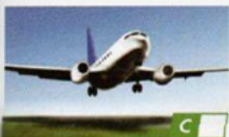
The nose is lifted into the air.