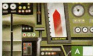
The engine is powered up.