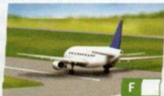
The plane is lined up on the runway.