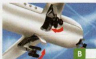
The wheels are pulled up.