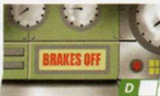
The brakes are taken off.