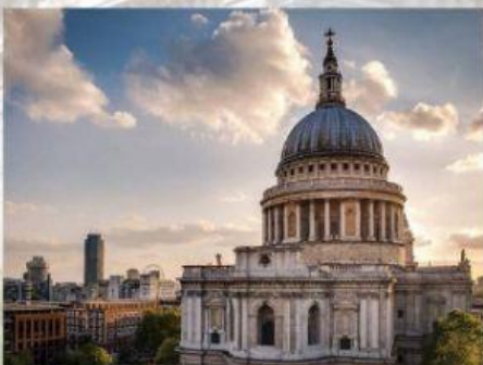
St. Paul's Cathedral