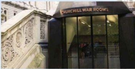
Churchill War Rooms