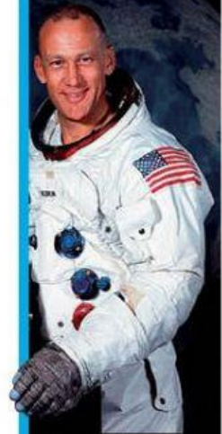
'Buzz' Aldrin: walked on the moon in 1969