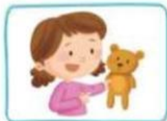
This is a teddy bear.