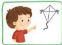
That is a kite.