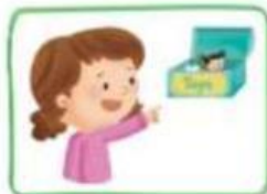
That is a toy box.