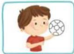
This is a ball.