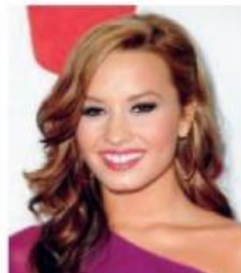
Fraser Harrison/Getty Images

Available at: < www.biography.com/people/demi-lovato-481444 >. Accessed on: December 7, 2017. (Fragment).