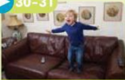
6.2 Grammar video