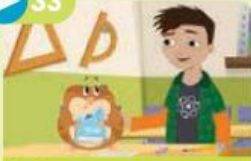
6.3 Grammar animation