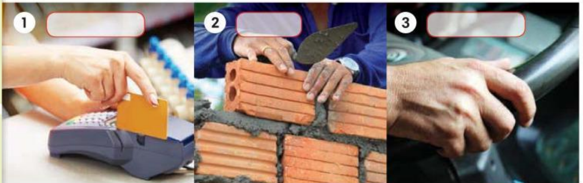
MY PHOTO ALBUM