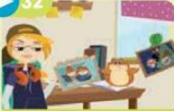
6.2 Grammar animation