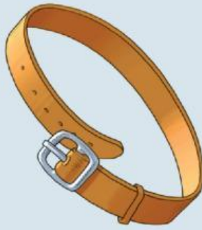
b b _ _ _