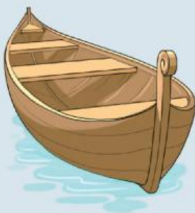
e b _ _ _