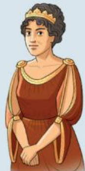
d q _ _ _ _