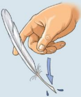
a d rop

1 Find words from Chapter 4 to match the pictures.