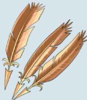
f f _ _ _ _ _