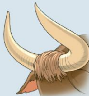
g h _ _ _ _