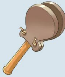
c r _ _ _ _