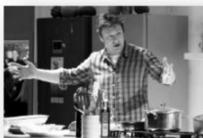
3. cookery show/ game show