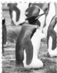
2. adventure/ documentary