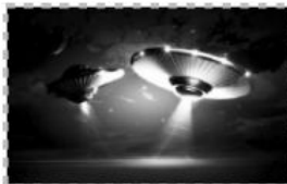
1. thriller/ science fiction