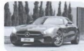
Mercedes AMG S: 300 km/h