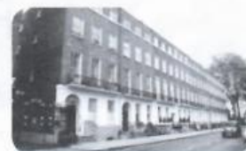
town house: 7 bedrooms