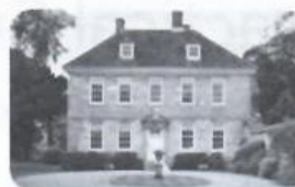
country house: 10 bedrooms