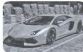
Lamborghini Aventador: 350 km/h