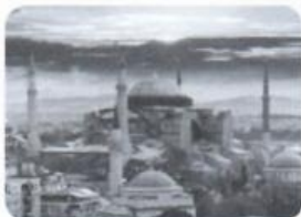
Istanbul: 805mm rain

The flight from London to Venice is shorter than the train journey.