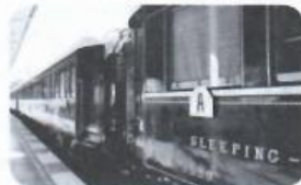
train journey: 2 days

The flight from London to Venice is shorter than the train journey.