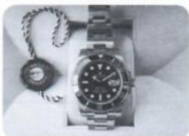
men's watch: £35,750