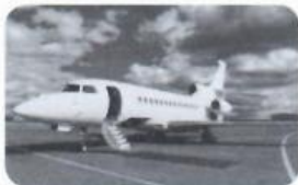
flight London to Venice: 3 hours