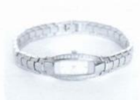
women's watch: £28,700