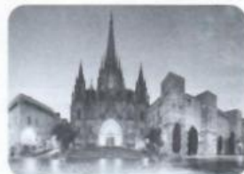
Barcelona: 640mm rain