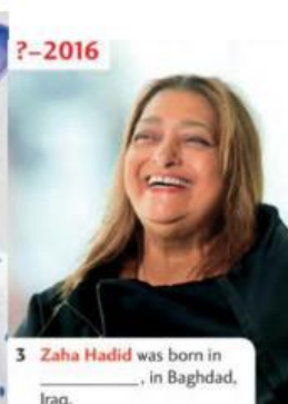
3 Zaha Hadid was born in 1950 in Baghdad, Iraq.