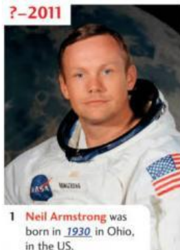
1 Neil Armstrong was born in 1930 in Ohio, in the US.