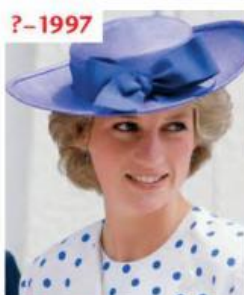
2 Diana Spencer was born in 1961 in Sandringham, England.