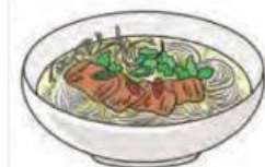
6. onoleds _____