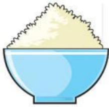
1. ecir rice