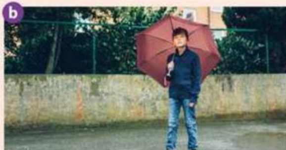
I take an umbrella when I go outside.