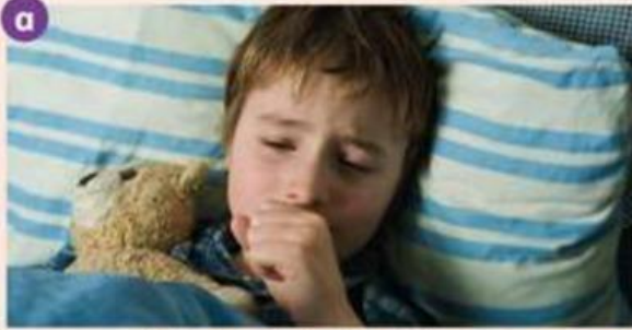
He stays home and rests.