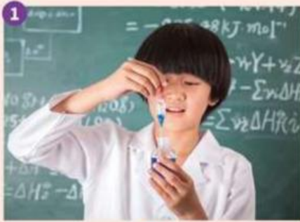
She's smart .