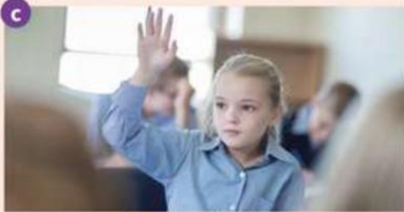
She raises her hand.