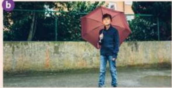
I take an umbrella when I go outside.