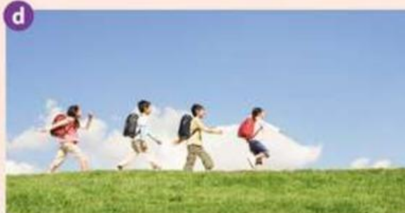
They walk to school.