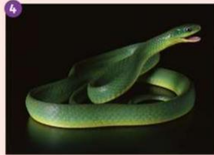
It's unfriendly .