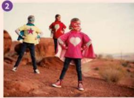
They're brave .