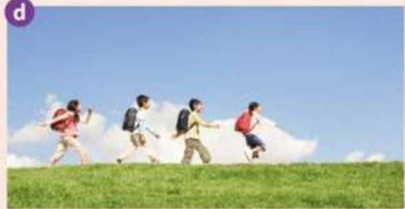
They walk to school.