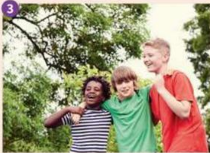
They're friendly .