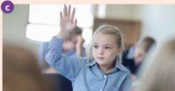
She raises her hand.