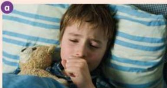
He stays home and rests.