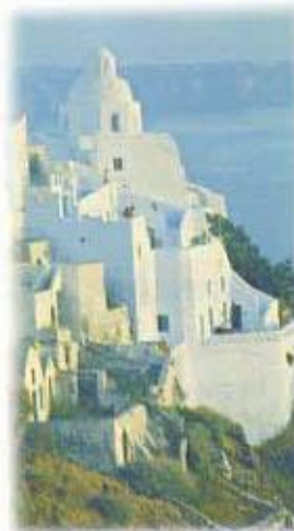
Santorini - Greece