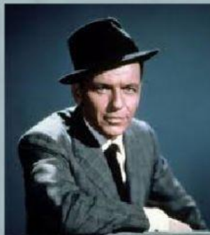
Frank Sinatra: 'The Voice'

Elvis Presley was called: 'The King of Rock & Roll'