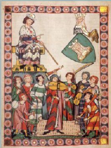
Musicians in the Middle Ages.