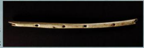
The ancient flute made of bone.

It is probable that the first musical instrument was the human voice, whistles, clapping hands, making noises with sticks... In 2008 archaeologists discovered a bone flute in a cave in Germany. It is considered to be about 35,000 years old. The five-holed flute was made from a vulture wing bone.