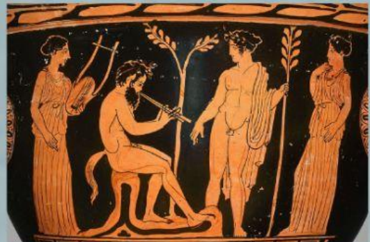
Music in Ancient Greece

In Greece, music was an important part of ancient Greek theatre. Their choruses sang for entertainment, celebration and spiritual reasons. There were wind and string instruments like the lyre and kithara. Music was an important part of education in ancient Greece, and boys studied music starting at age of six.