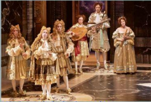
Singing and playing in a palace.