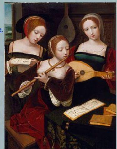
Music in the Renaissance.

The invention of printing press had an immense influence on the dissemination of musical styles. The most famous type of composition was 'the madrigal'.