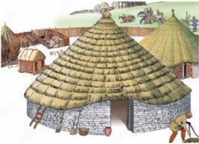
1- Stone house