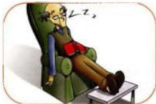
1 Grandpa is sleeping.