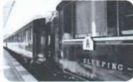
train journey: 2 days

The flight from London to Venice is shorter than the train journey.