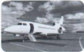
flight London to Venice: 3 hours