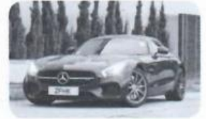
Mercedes AMG S: 300 km/h