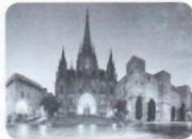
Barcelona: 640mm rain