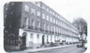
town house: 7 bedrooms