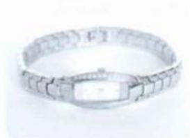
women's watch: £28,700