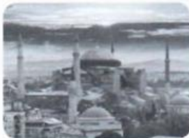
Istanbul: 805mm rain

The flight from London to Venice is shorter than the train journey.