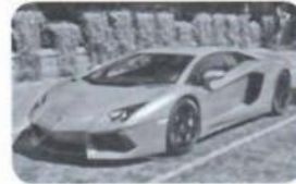
Lamborghini Aventador: 350 km/h