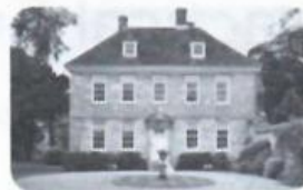
country house: 10 bedrooms