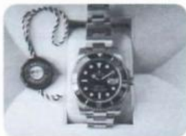
men's watch: £35,750