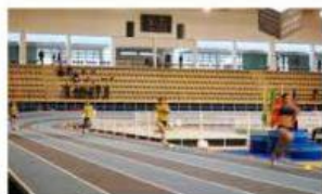
1. sports center

sports center bowling alley theater ice rink water park market fair