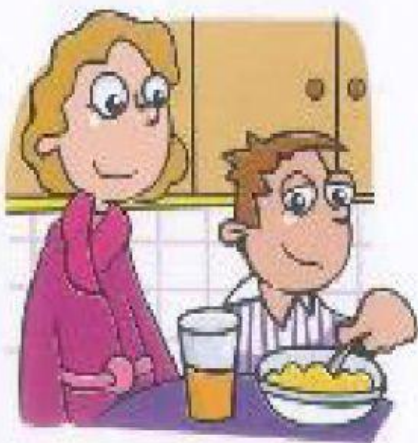
1 Good _____.

3 Look at the pictures and write. Then act it out.