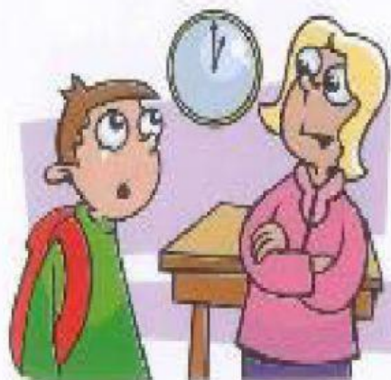
2 Good _____.