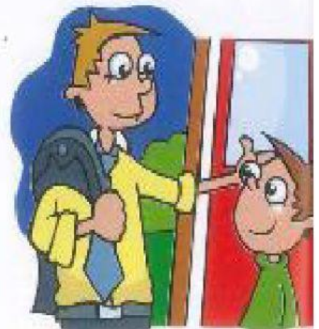
3 Good _____.