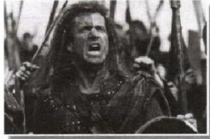
Mel Gibson as Sir William Wallace in "Braveheart"

Mel Gibson is a famous Hollywood actor and director. He was born on the third of January 1956. In 1977 he graduated from the National Institute of Dramatic Arts in Australia. His cinema career began in 1978. Since then, Mel Gibson has never looked back. Probably his most famous film is "Braveheart". Gibson says that when he received the "Braveheart" script, he rejected it because he thought he was too old to play the part. But after careful thinking, he decided not only to act in the film, but to direct it as well. "Braveheart's" success established Gibson permanently in Hollywood.