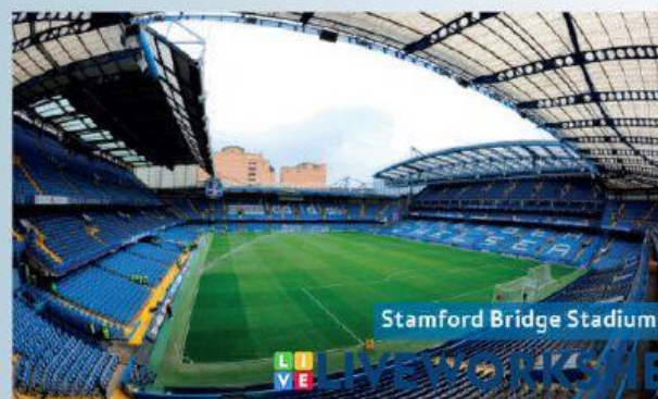
Stamford Bridge Stadium

The girls were a bit surprised, and they asked the taxi driver where they were. 'In Stamford Bridge,' he said. 'Where did you want to go?'