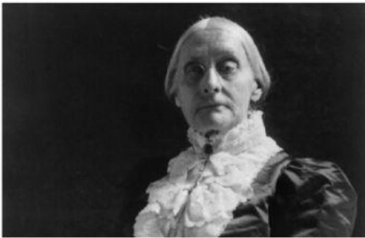
Susan B. Anthony

“_____ inspired change in her community by fighting for women’s right to vote.”