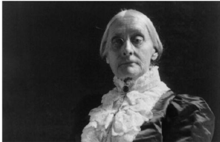
Susan B. Anthony

“_____ inspired change in her community by becoming an activist for women's right to vote.”