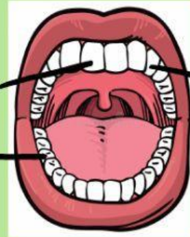
Mouth (milk teeth)

⚠ Words: incisor - oesophagus - mouth - molar - canine - stomach