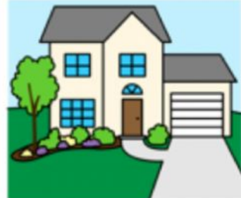
At her house