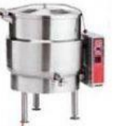
Table top steam kettle for making custards, creams and fillings. They are made of steel with double walls between which steam circulates to quickly and efficiently heat the liquid. Some versions 4 tilt and have a 5 lip for easy pouring.

Fryer for frying items like doughnuts and fritters.