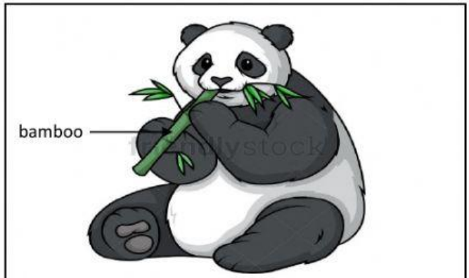
Document 2: Panda bear eating bamboo