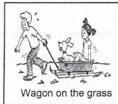
Wagon on the grass