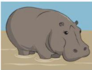
It's a hippo.