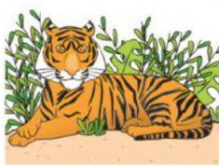
It's a tiger.