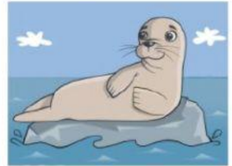
It's a seal.