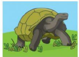
It's a tortoise.

2. Write the name of the animals. Listen and write the number.