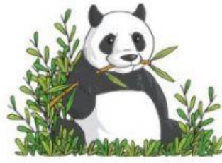
It's a panda.