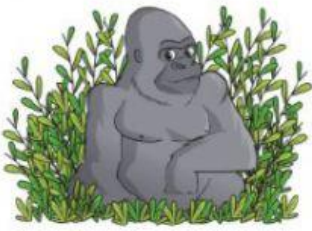
It's a gorilla.

1. Click on the animals, listen and read.