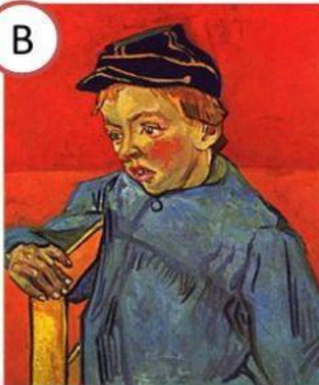
The schoolboy with Uniform Cap Vincent Van Gogh, 1888