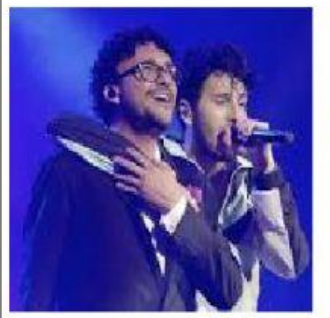
They ____ singers