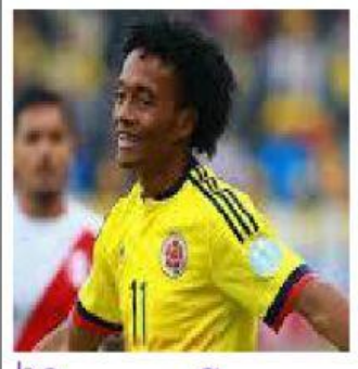
he ____ a footballer