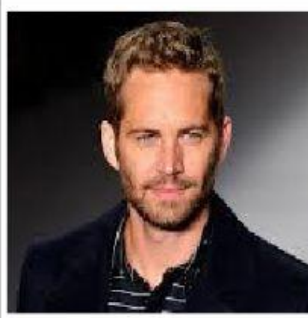
He ____ an actor