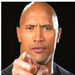
He ____ an actor