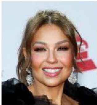
She ____ a singer