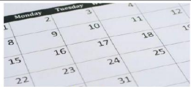
Today ____ Tuesday