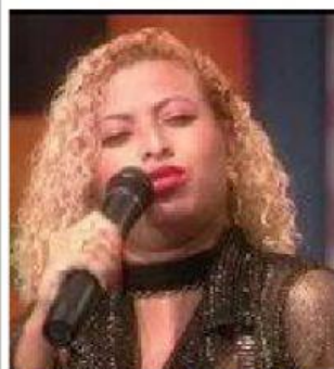
She ____ a singer