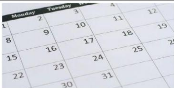
Yesterday ____ Monday