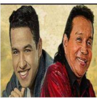
They ____ singers