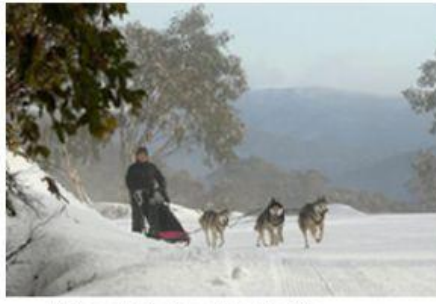
Mount Buller, Australia : ____