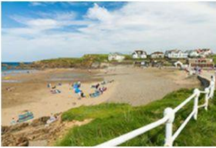
Cornwall, England : ____