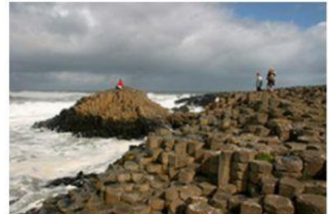
Giant's Causeway in Northern Ireland : ____