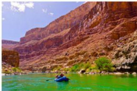
Colorado river in Marble Canyon, Arizona, USA : ____