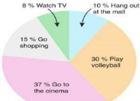
TEENAGERS AND THEIR FAVOURITE ACTIVITIES

I) Look at the graphics and write TRUE or FALSE. (Grafik bakarak TRUE veya FALSE yazınız.)