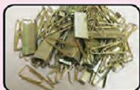
paper clips and staples

Choose the suitable method to separate the mixtures below.