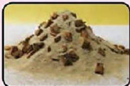
corks and sand