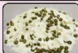
green beans and flour