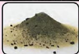
iron powder and beach sand