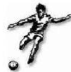
___ soccer player