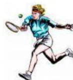
___ tennis player