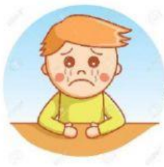
JOSÉ 7 YEARS OLD