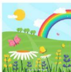
11-WINTER / SPRING