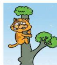
8- JUMP / CLIMB