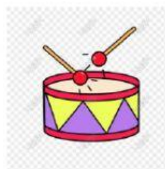
15-GUITAR / DRUM