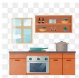
1-BEDROOM / KITCHEN

A - VOCABULARY: LOOK, READ AND CHOOSE (30 MARKS)