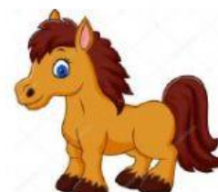
4- CAT / HORSE