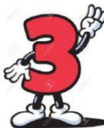
7-TEN / THREE