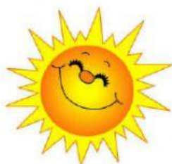
9- SUNNY / COLD