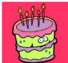
3-CAKE / PIZZA