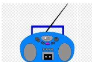
14- BED / RADIO