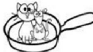
in the pan

5. Which is a possible setting for this story?