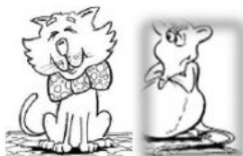
on a mat