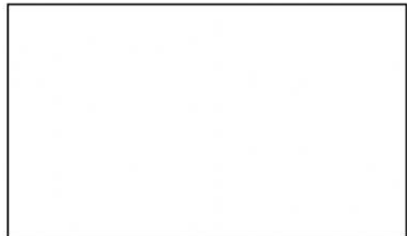
Draw a suspension bridge.

Explain why the suspension bridge is better for crossing longer distances than the beam bridge.