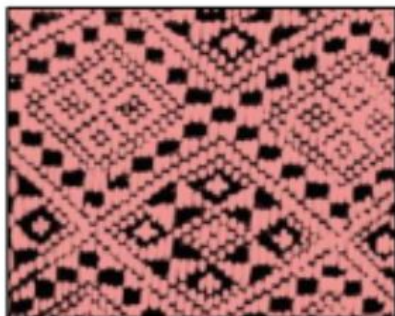
Textile of Ilocos

Can you identify the similarities and differences of the textile of Ilocos from the textile of Cordillera Province? How about the textile of Cagayan Valley from the textile of Mountain Province? Compare and contrast the types of textile according to their patterns, designs, colors, and material used.