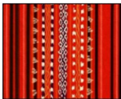
Textile of Cagayan Valley