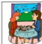
My mother and father