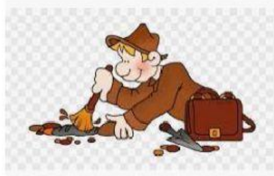
13. Visit archeological sites / See flora and fauna