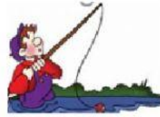
10. Go fishing / Take pictures