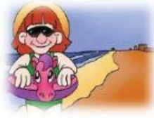
9. Go to the beach / Go fishing