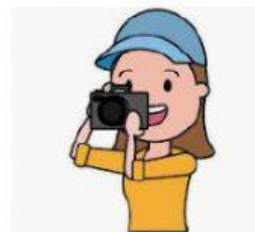
15. Take pictures / Swim