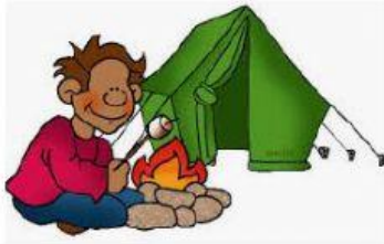
11. Swim / Go camping