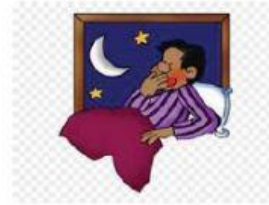
12. Eat delicious food / Stay in a hotel