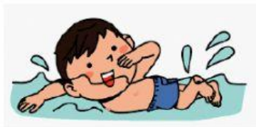
14. Swim / Stay in a hotel