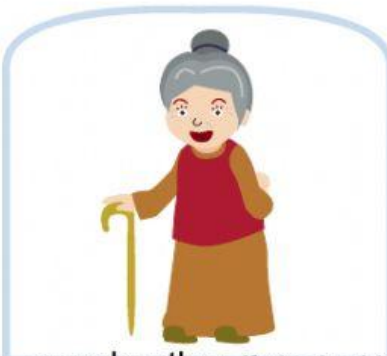
grandmother (father's side) nǎi nai