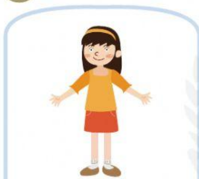
older sister jiě jie