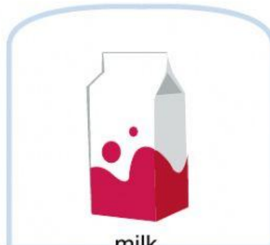
milk niú nǎi