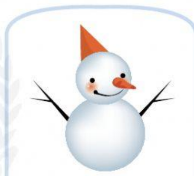
snow man xuě rén