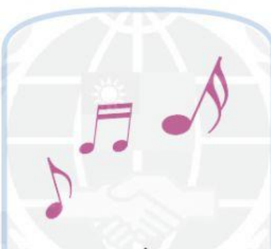
music yīn yuè