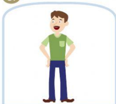
uncle shú shu