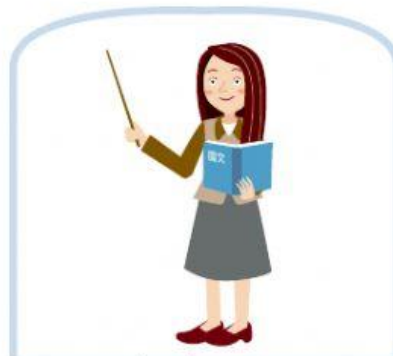
teacher lǎo shī