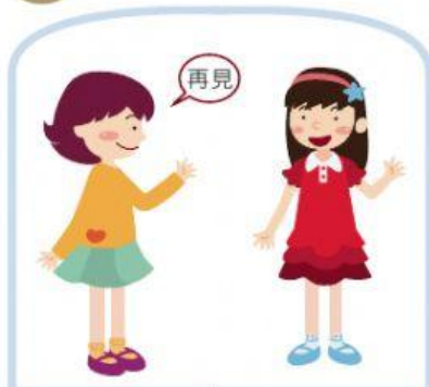
goodbye zài jiàn