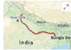
INDIA – FROM NEW DELHI TO BANGLA DESH