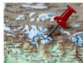
BETWEEN NEPAL AND CHINA