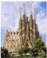
SAGRADA FAMILIA CHURCH