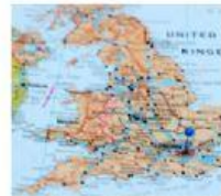
UNITED KINGDOM - LONDON