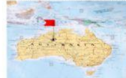
AUSTRALIA – PACIFIC OCEAN