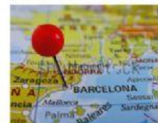
SPAIN - BARCELONA