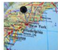
U.S.A. – NEW YORK