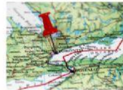
BETWEEN CANADA AND UNITED STATES