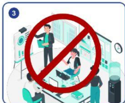
Meetings are prohibited