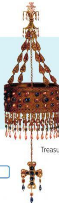
Treasure of Guarrazar

The Visigoths were excellent metal workers. They made the Treasure of Guarrazar – a collection of more than 200 crowns and gold crosses. They gave the Treasure of Guarrazar to the Catholic Church to show their loyalty in the 7th century.