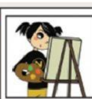
3 I'm painting.