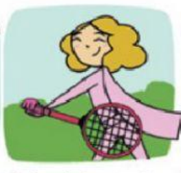
3 I'm playing tennis.