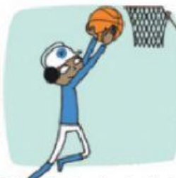
2 I'm playing basketball.