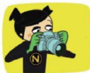
5 I'm taking pictures.