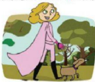
6 I'm walking the dog.