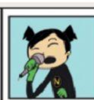
4 I'm singing.