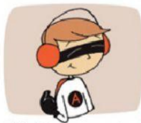
1 I'm listening to music.