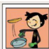
1 I'm cooking.