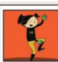
2 I'm dancing.