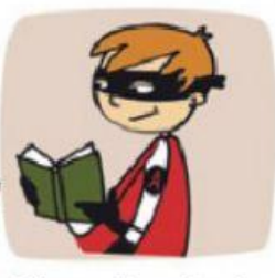
4 I'm reading a book.