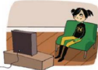
7 I'm watching TV.