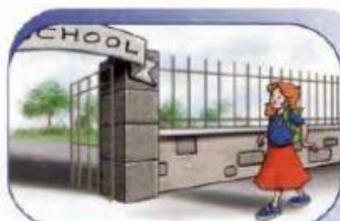
go to school

Ask and answer questions as in the examples: