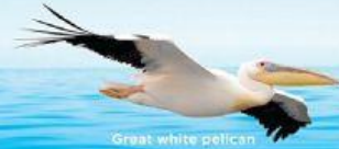
Great white pelican

The deeper in the ocean you go, the less sunlight there is. Some animals always live in one zone, while others travel between zones to hunt and feed.