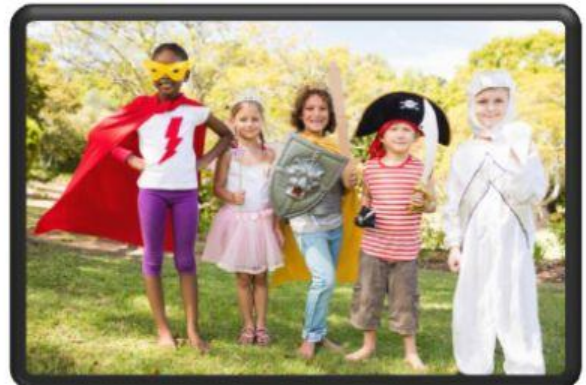
FANCY DRESS PARTY