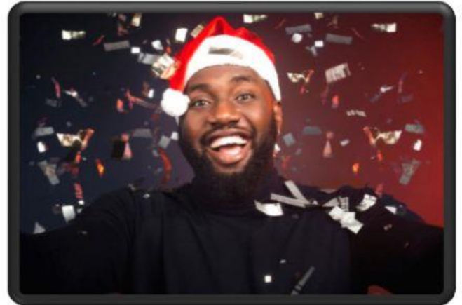
NEW YEAR'S PARTY